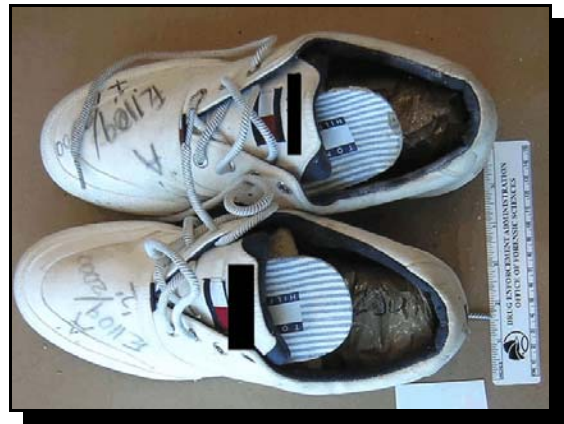
Photo 5 - Ruler is 6-Inch

The DEA Mid-Atlantic Laboratory (Largo, Maryland) received three pairs of different color and style “designer”-brand boat shoes, each containing a package of white powder under their insoles, suspected cocaine (see Photo 5). The exhibits were seized by Jamaican authorities from a cruise ship docked at Kingston, and were remanded to the DEA Jamaica Country Office for laboratory analysis. Each package consisted of a plastic bag wrapped with tape. Analysis of the powder (total net mass 2.7 kilograms) by GC/MS, NMR, FTIR-ATR, and GC/FID confirmed 32, 46, and 61 percent cocaine hydrochloride, respectively, all adulterated with nicotinamide (not quantitated).