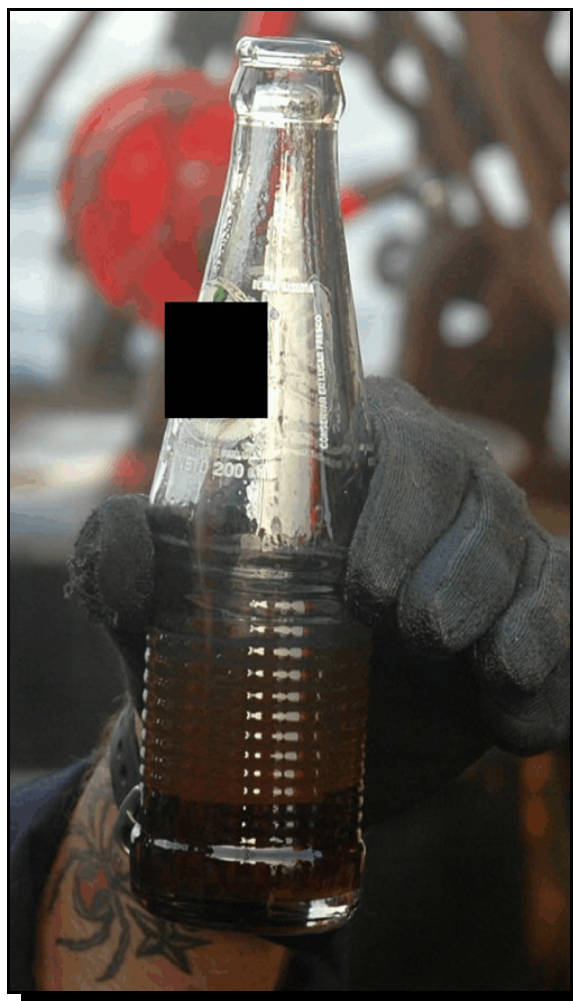
Photo 1 - Note Lower, Darker Layer

The DEA Special Testing and Research Laboratory (Dulles, Virginia) recently received a small amount of a biphasic liquid suspected to be a mixture of diesel fuel and an aqueous solution of cocaine (see Photo 1). The exhibit was a representative sample taken from approximately 3,850 gallons of liquid seized from a fish-holding tank on an Ecuadorian fishing boat, the Emperador , which was apprehended by the U.S. Coast Guard in international waters in the east Pacific Ocean (see Photos 2 - 3, next page). The liquid was estimated to be approximately 2,000 gallons of diesel fuel overlaying approximately 1,850 gallons (7,000 liters) of the aqueous solution. Preliminary testing indicated that the top layer was consistent with diesel fuel. Following standard acid/base workup and chloroform extraction of the aqueous layer, analysis by GC/FID, GC/MS, NMR, and FTIR confirmed cocaine (salt form not determined) at 340 milligrams per milliliter (calculated as the base). This equals approximately 2,380 kilograms of cocaine base total in the seizure. This was the first submission of this type to the Special Testing and Research Laboratory.