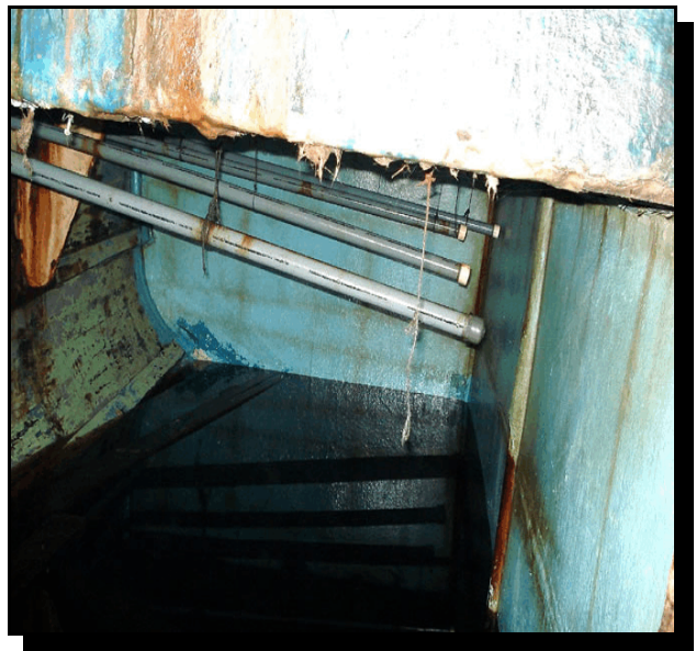
Photo 3 - The Fishhold