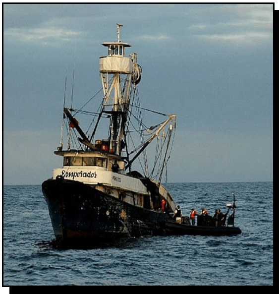
Photo 2 - The Emperador