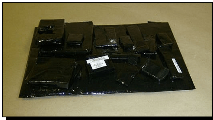
Photo 8 - Removed Packages

[Editor's Notes: Laptop computers (both pseudo-operational and non-operational) containing heroin have been previously submitted to the DEA Northeast, Mid-Atlantic, and Southeast Laboratories; for recent examples, see: Microgram Bulletin 2008;41(1):3 and 2008;41(3):29. Various computer components have been similarly employed; for example, see: 2008;41(2):19.]